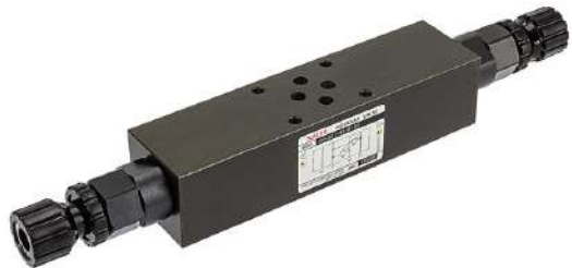
Modular relief OR type