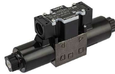
Solenoid Valve NG6 SS with terminal box