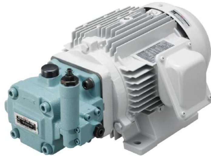
Vane motor pump