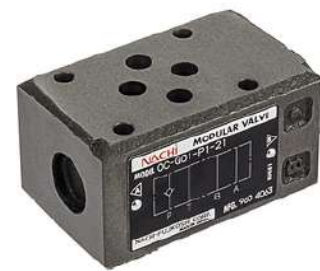
Modular check valve OC type