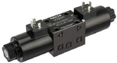
Solenoid Valve NG6 SA